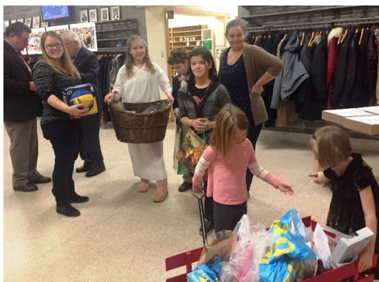
White Gift Sunday